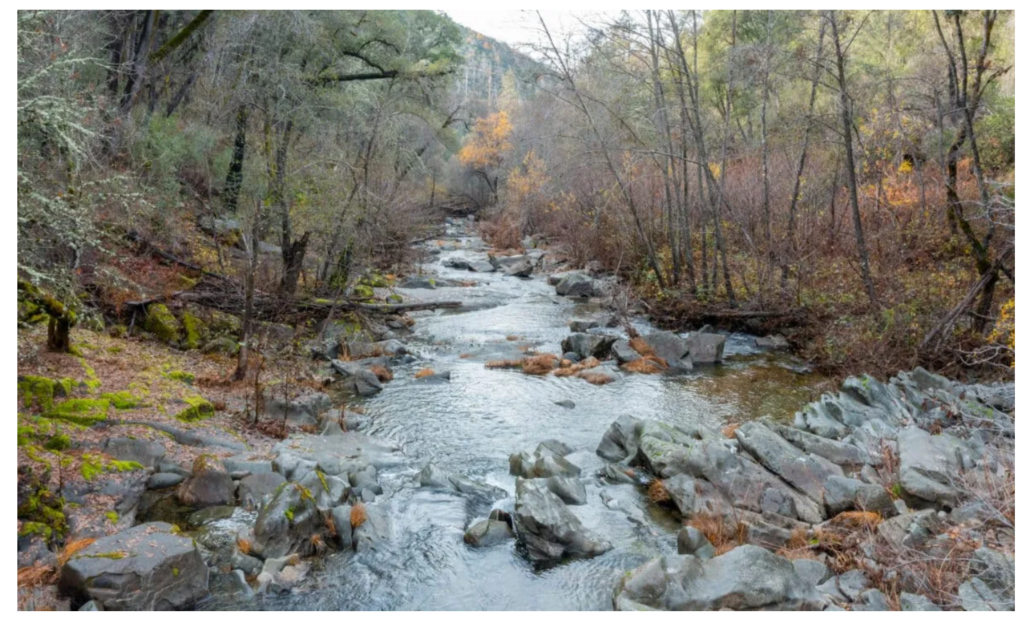
$675,000 120± Acres El Dorado County